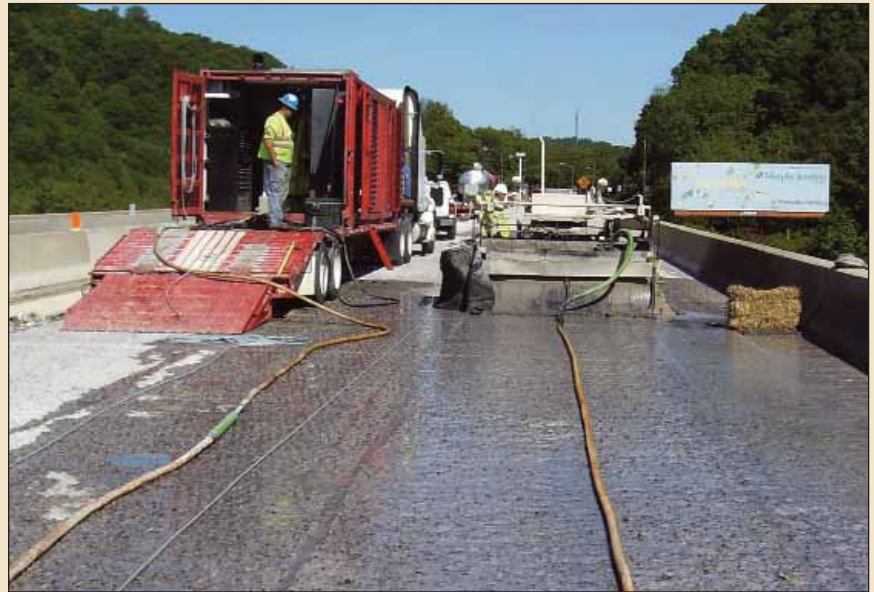
PA 61 Bridge Rehabilitation Project (over the Schuylkill River).

The need is real – doing nothing is not an option.